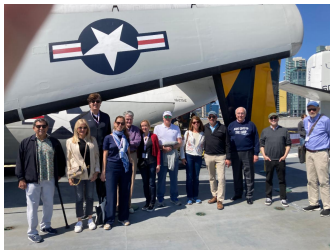
U.S.S. Midway Tour